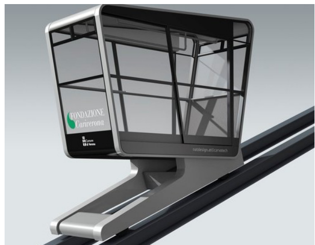
car - rendering