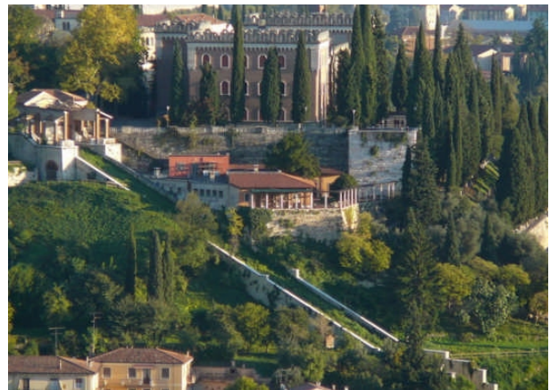
line - side view