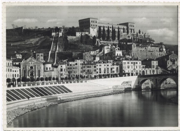
line - historical view

TIME PERIOD OF SERVICE PERFORMANCE: 2007-today