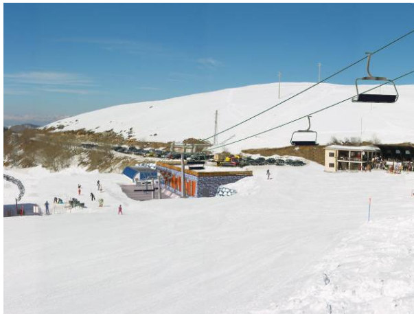
Lower station - rendering