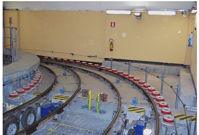
Switch – transition curve