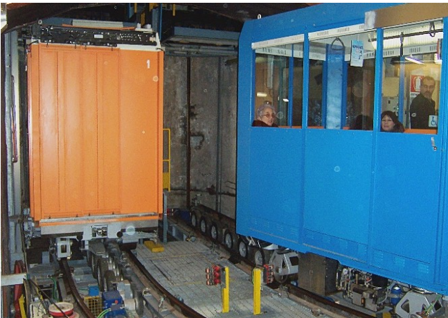
Passage phase from the vertical lift to the horizontal line

TIME PERIOD OF SERVICE PERFORMANCE: 1998