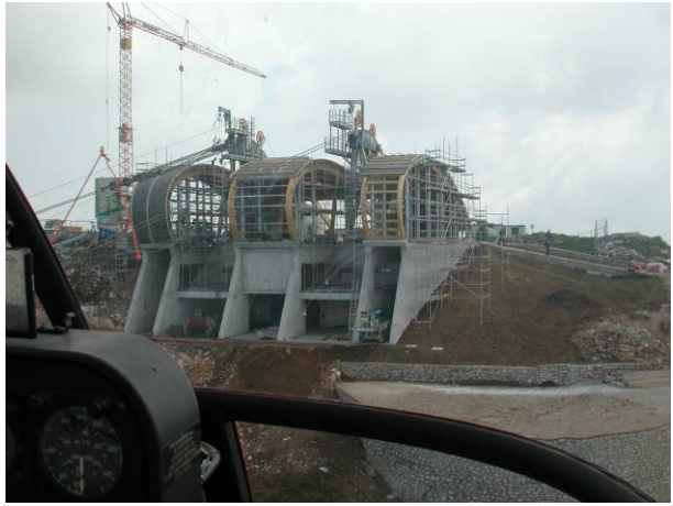
Building yard of the top station

DESCRIPTION OF THE PROJECT : Slope length