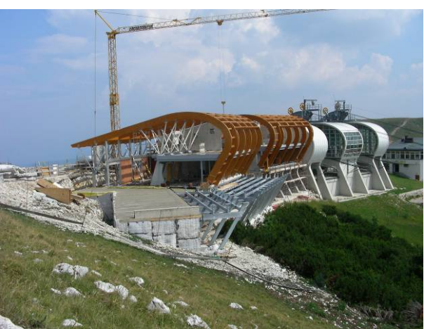
Building yard- view from north