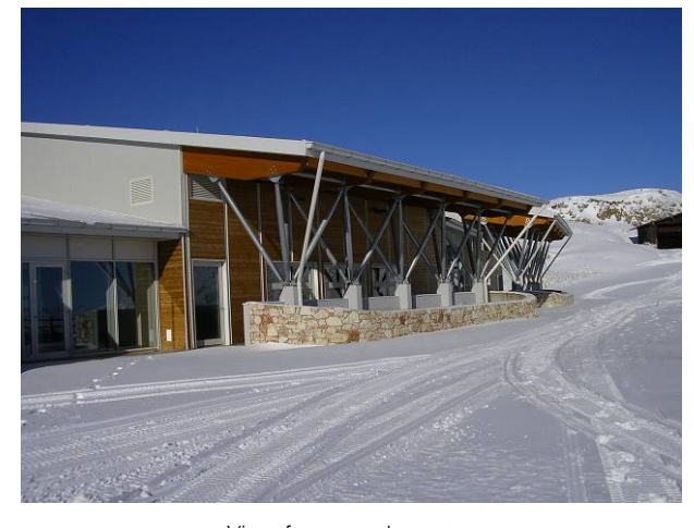
View from south-east