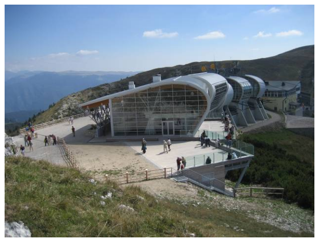
View from north